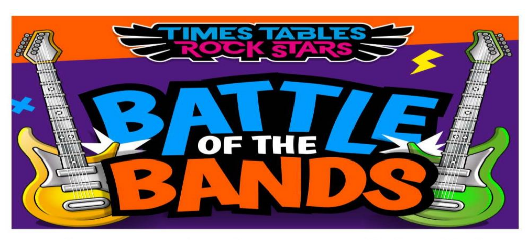
Hale Prep TTRS and Numbots Tournament (Spring Edition)

There has been a great response to week 1 of the Spring TTRS and Numbots tournament and well done to all the classes who made it through to the next round. The average coins per child in each class can be seen in the tournament bracket below.